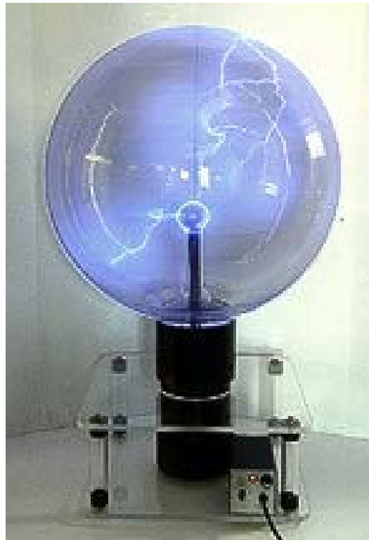
Sample 12" Plasma Globe In one of our custom made stands

NOTE Shut down is factory set to shut down when a 4"x 48" external electrode column is to the point of being overpowered. This is approximately at .7 amps as read on an external ammeter. Shut down is a function of output voltage usually allowing larger loads to be more easily operated as they have a tendency to keep the voltage low due to "real" loading.